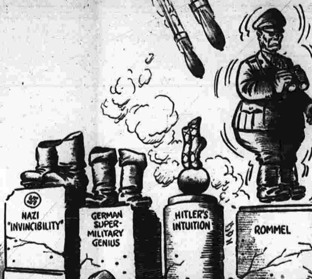
Illustration of a man in a military-style uniform, possibly representing a soldier or a leader.